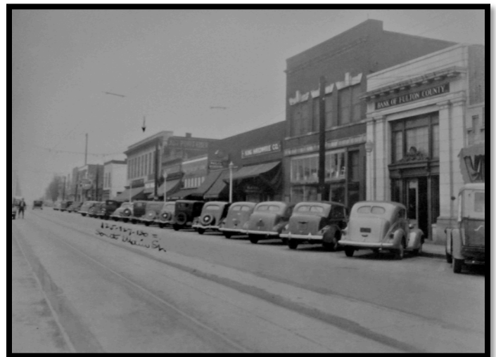
Two historic photos of East Point, Georgia, which are available for viewing at EPHS